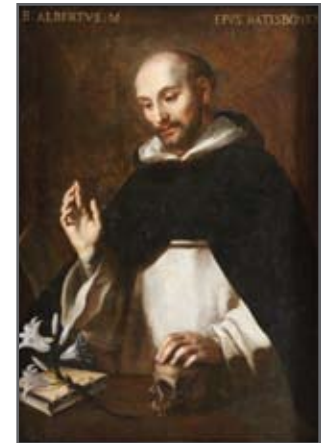
St. Albert the Great

On the other hand, it does not follow that a school which does define itself in the context of those distinctions will be successful in realizing its true purposes. The condition is necessary but not sufficient. For even given that the importance of distinguishing the primary from the secondary — in all the ways mentioned above — is a matter of conviction, and given that the distinctions are actually seen in many cases, there still remain many ambiguities whose attempted resolution may ultimately defeat the intended