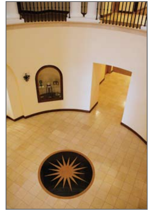
The sunburst, symbol of St. Thomas Aquinas

Since academic freedom is thought to derive from and be justified by the principle of free inquiry, and since in turn considerations of academic tenure are supposed to be governed by the principles of academic freedom, the college professor comes to be judged by stan-