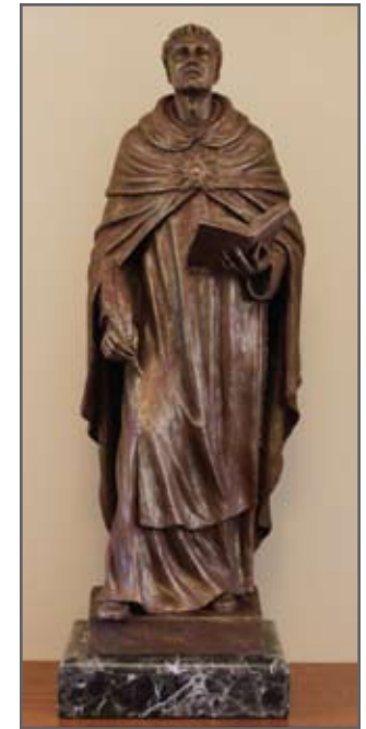
St. Thomas Aquinas