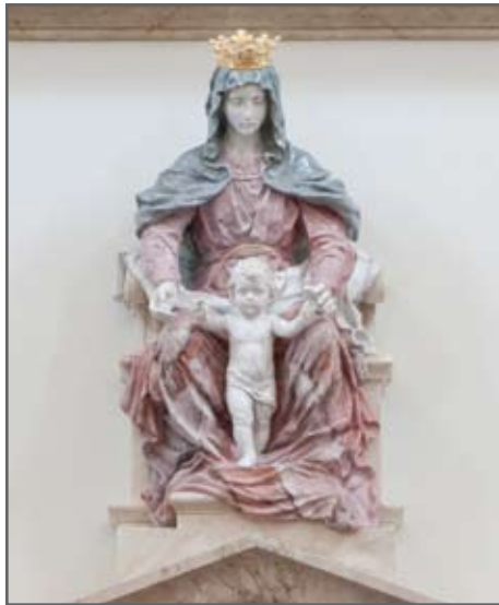
Our Lady, Seat of Wisdom

Accordingly, to speak in summary, the Christian intelligence is formed by an acceptance of certain fundamental distinctions and a recognition of the order among the objects of thought: some are of faith, others of reason; some certain, others doubtful; some self-evident, others not; some demonstrable, others not; some subject to criticism, others not. This awareness of the distinction between the primary and the secondary in human knowledge makes true freedom of inquiry possible, for only the recognition of the difference between the unquestionable foundations of criticism and doubtful matters subject to criticism can give reasonable direction to inquiry. Or to speak generally, to live in freedom is to live by the truth.