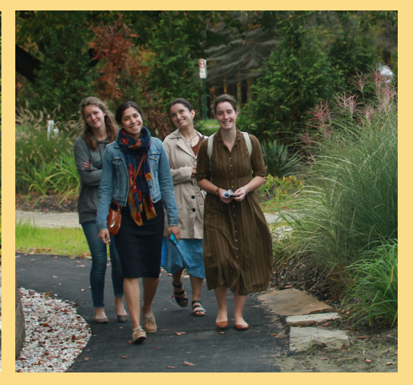
me 30 students made a pilgrimage to the s, for a day of prayer and reflection.